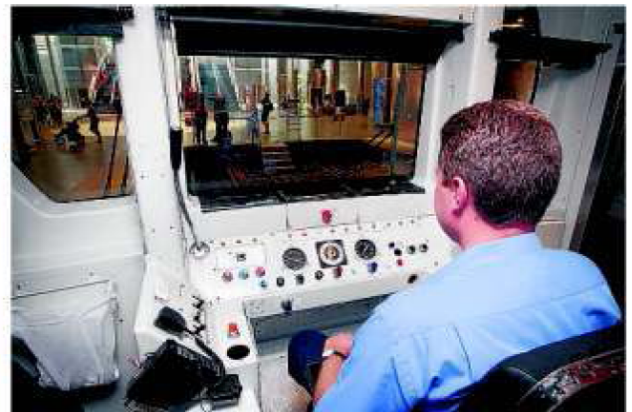
The new train cab (left) has more room and better visibility than the old train cab (right).