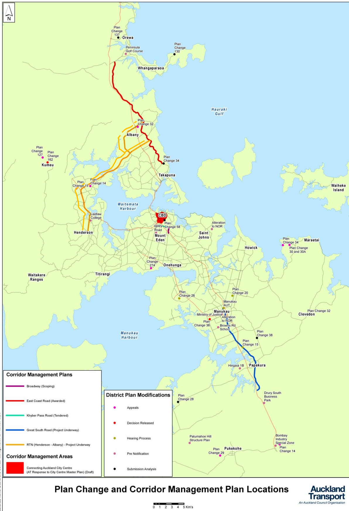
Figure 1 – Plan Change and Corridor Management Plan Locations

Published Name: District and Corridor Management Plan 02032012.pdf